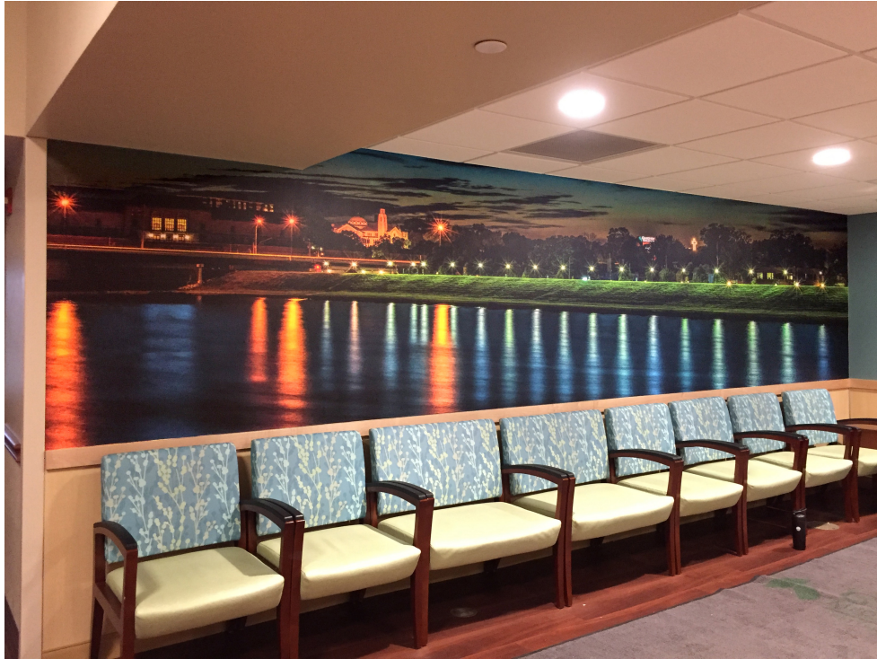
COX Enterprise World Headquarters, Atlanta, GA