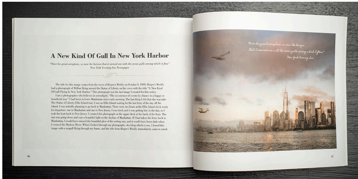
In the fall of 1909, Wilbur Wright made flight demonstrations in New York City as part of the Hudson-Fulton Celebration. Wilbur made several flights up and down the Hudson River and thrilled hundreds of thousands of New Yorkers.