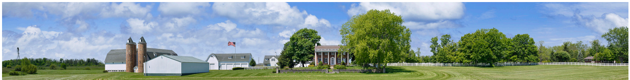
Cox Discovery Center, 24 ' x 3 ' photograph of Gov. Cox boyhood farm in Middletown, Ohio to be used in the Cox Discovery Center.